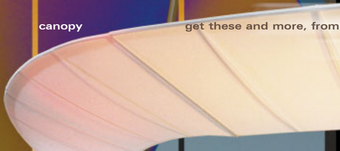
get these and more, from